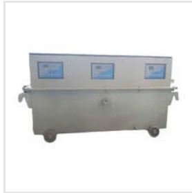
25 Kva Servo Stabilizer