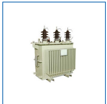
200 KVA DISTRIBUTION TRANSFORMER