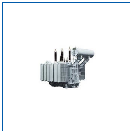
250 KVA DISTRIBUTION TRANSFORMER