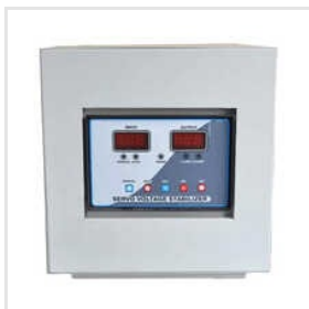
Servo Voltage Stabilizer