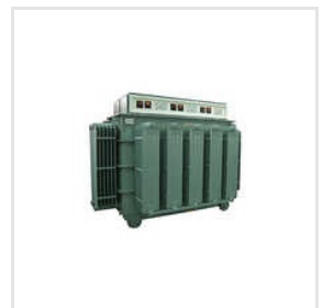
Digital Voltage Stabilizer