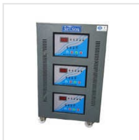
MS Three Phase Servo Stabilizer