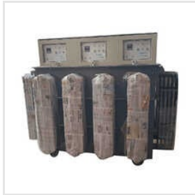
Oil Cooled Servo Voltage Stabilizer