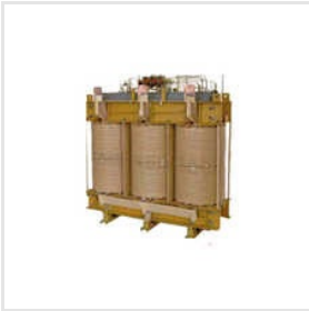
Three Phase Isolation Transformer