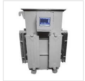
Three Phase Power Supply Load Oil Cooled