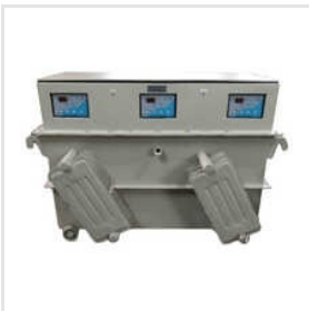
MS Servo Voltage Stabilizer