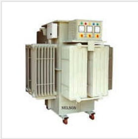
Electrical Power Transformer