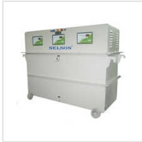
Three Phase Oil Cooled Servo Voltage