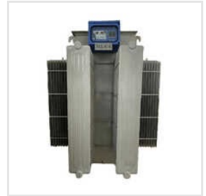
Three Phase Automatic Voltage Controller