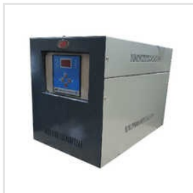
5 Kva Servo Voltage Stabilizer