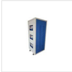
15 Kva Servo Voltage Stabilizer