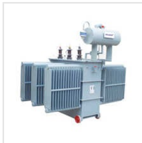
Power Distribution Transformer