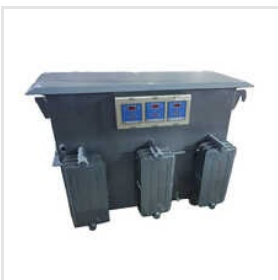
Three Phase Servo Stabilizer