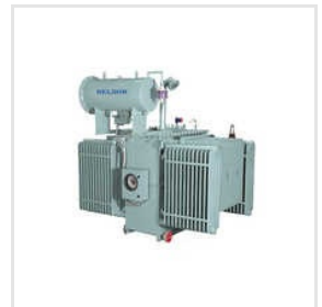
500 Kva Distribution Transformer